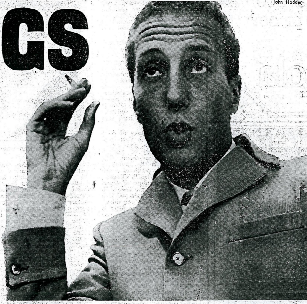
FREDERICK FORSYTH: planned and financed the coup against Equatorial Guinea.

Forsyth even improved on his plan. The Dogs of War recounts, for instance, the revised procedure for paying arms dealers that Forsyth and Gay in reality worked out only after the Hamburg debacle. And though Forsyth mentions the Albatross by name, it is only to dismiss it as unsuitable.