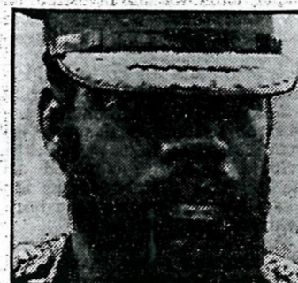
GENERAL OJUKWU: denies involvement in the affair.