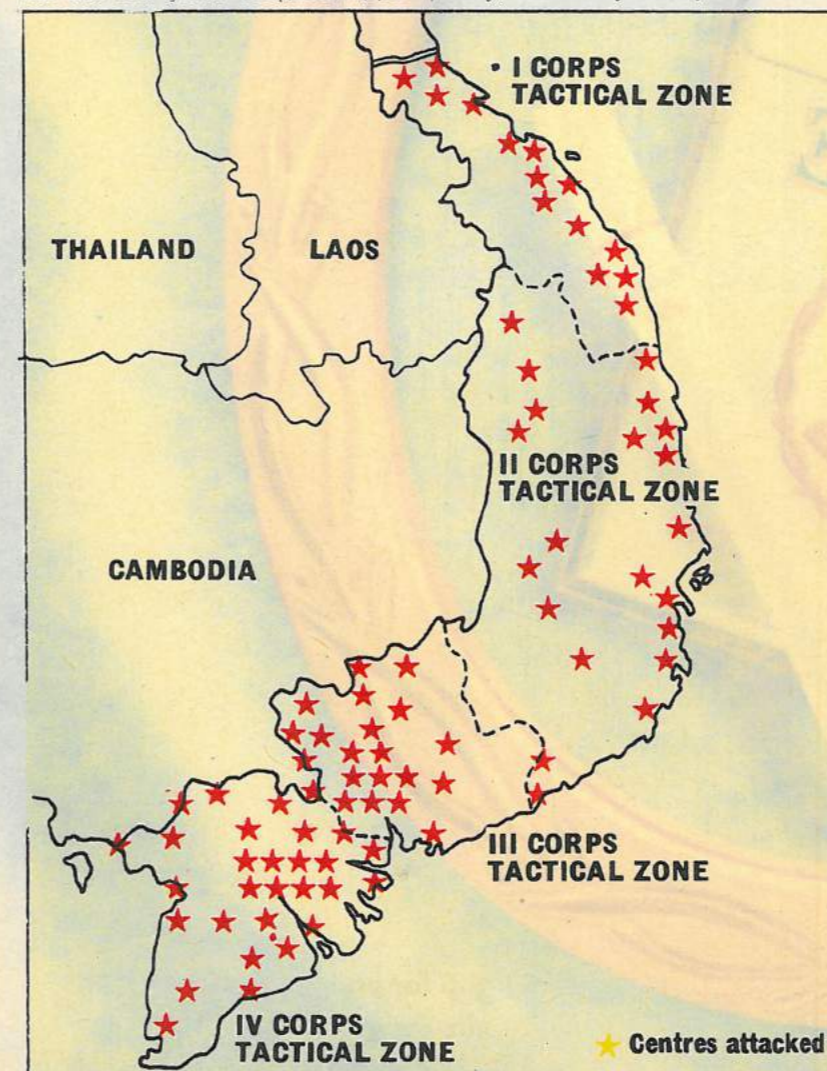
The Tet Offensive, 1968: the psychological blow replaced hopes for military victory. NLF North Vietnamese units simultaneously attacked more than 800 centres when Westmoreland said the U.S. were winning