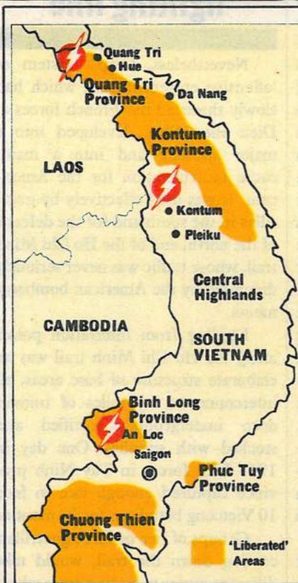
Left: areas controlled by the 'People's Revolutionary Government' of South Vietnam after one month of the 1972 offensive. Above: some of Giap's new Russian armaments - a T54 tank and a 130mm. field gun

Giap on the other hand is pro-Soviet, as much as his position allows, and actively anti-Chinese. He is given to making warnings to China not to threaten Vietnam's independence. Like every Vietnamese he is aware of China's imperialist past in Vietnam - when China has been strong she has invaded and subjugated the Vietnamese. Truong Chinh, however, trained in China like Giap, has never wavered from the Maoist line. "When I reminded Giap in 1945 that the Chinese had been charged with disarming the Japanese, he was visibly shaken," said Jean Saintenay, the French Commissioner in Hanoi who