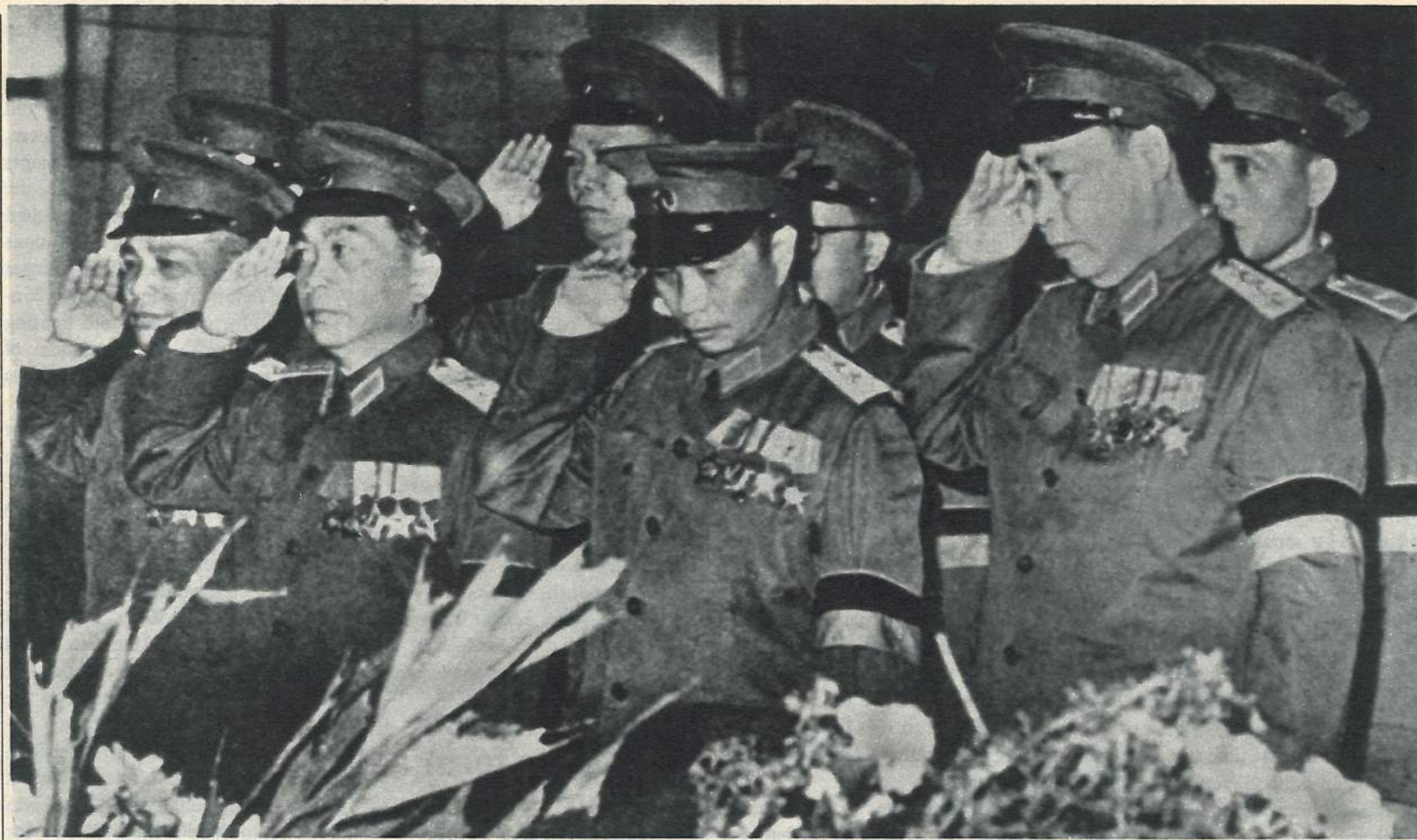
Above: General Giap and his fellow officers pay homage to 'Uncle' Ho Chi Minh during his funeral in 1969