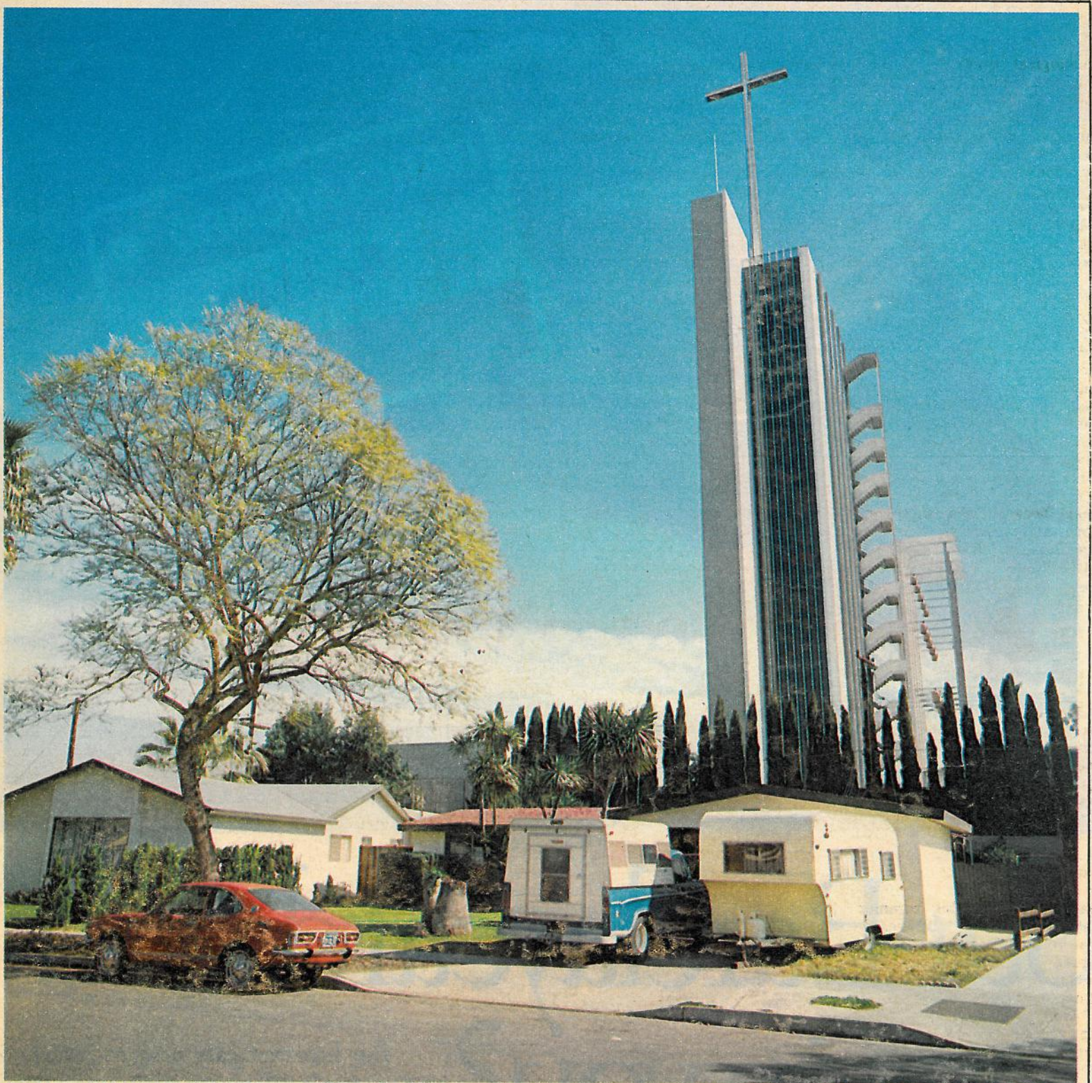
Reminiscent of a fire station, the Tower of Hope rises high above the rich suburbs of Garden Grove. Schuller began his mission from a trailer

← that it contains Bible verses, 'very carefully selected', which emphasise only positive emotions, 'because there are many verses in the Bible that are negative, and God would never intend for you to misuse His word. Unfortunately,' he muses, 'many people who understand theology remain insensitive to negative and positive appraisures.'