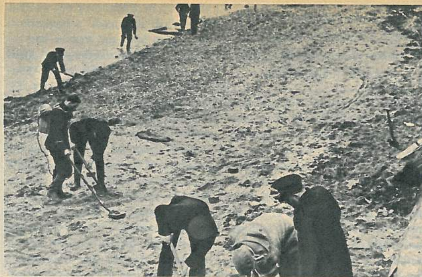
The search for clues – with mine detectors on Whiteabbey beach