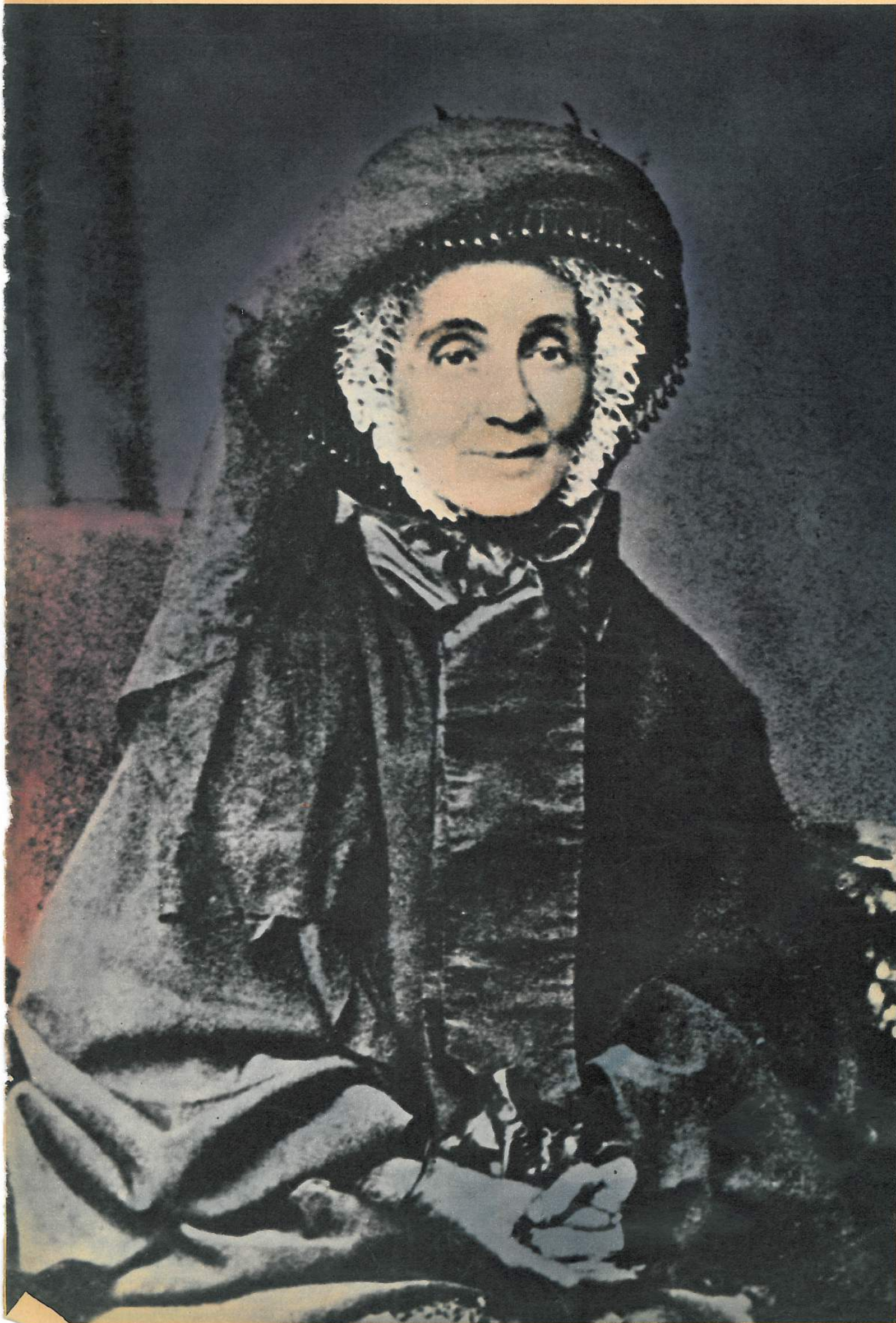
The Dowager Lady Tichborne in 1868. "When she entered the bedroom she was obviously determined to recognise her son. 'Oh, my dear Roger, is it you?' she said, lifting the handkerchief from his face - and he had come too far to deny it"