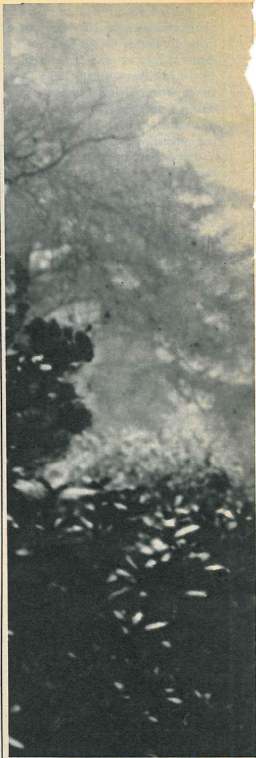
The driveway of the Glen. The body