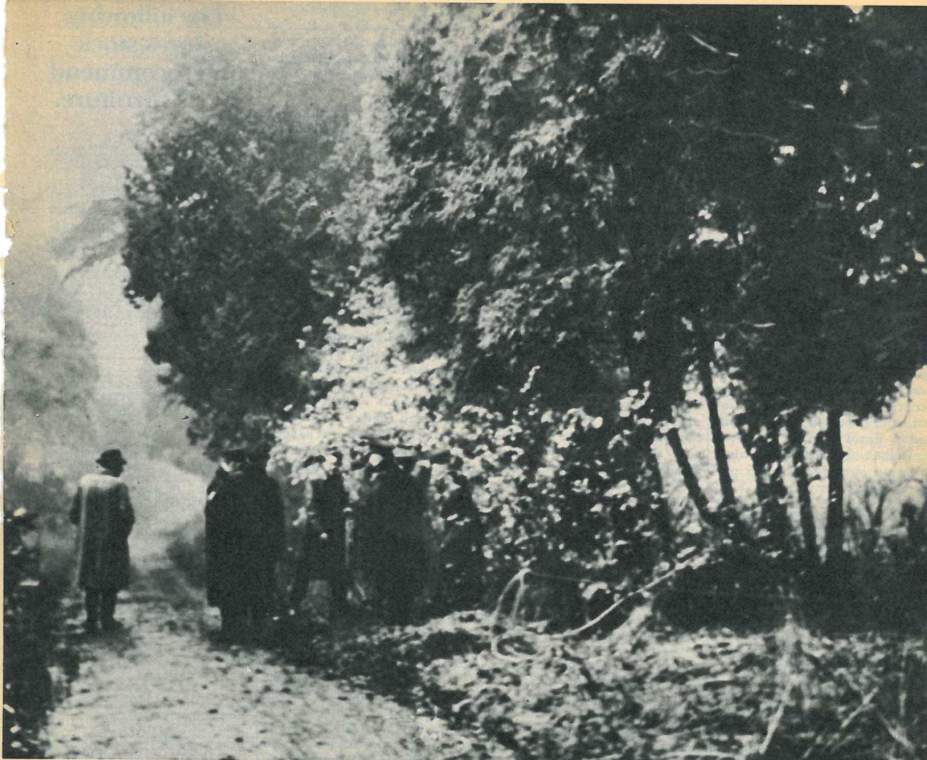
was found in the undergrowth on the right. Her belongings lay near the edge of the drive, but several people passed by without seeing a thing