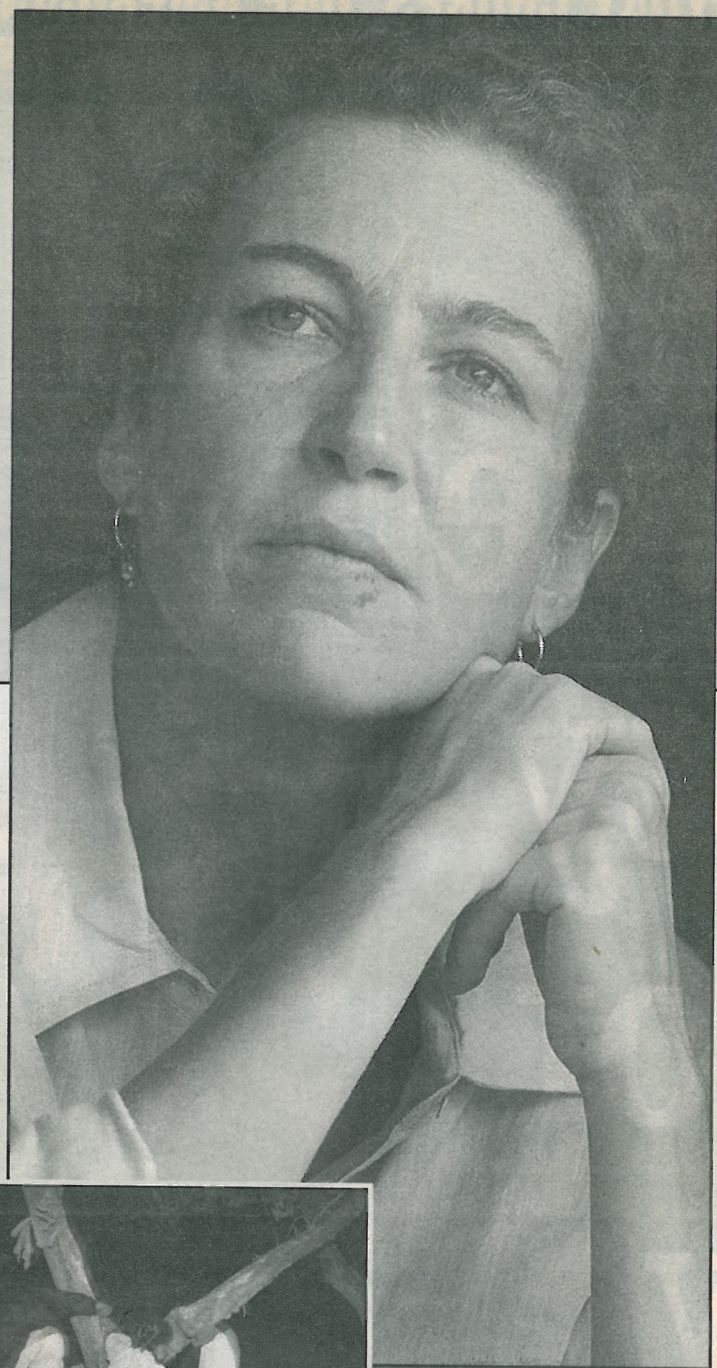
REIGN OF TERROR: Marie Colvin, above, whose reports shamed the UN and helped save the lives of 1,500 refugees. Left, terrified Timorese flee the militia by seeking refuge within the UN compound in the capital, Dili

A MID the slaughter and butchery of East Timor, the tenacity of one woman — and her satellite telephone — helped to save 1,500 lives and possibly the reputation of the United Nations itself. Marie Colvin, 43, a roving foreign correspondent, chose to stay in the besieged UN compound in Dili on Friday, September 10, along with 80 UN personnel and 1,500 terrified