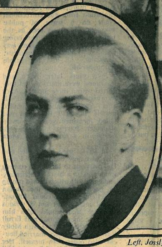
Left, Josslyn Hay, 23, the future Earl of Erroll and Hereditary High Constable of Scotland; right, Idina, with elephant tusks

In the 1960s, the affair became an obsession of Cyril Connolly, the literary critic. Many of the men involved in it had been his contemporaries at Eton and had then been transplanted to a near feudal life-style - which stirred Connolly's envy - in the magnificent Kenyan landscape - which Connolly admired profoundly. With James Fox acting Watson to his Holmes, Connolly spent months investigating the murder for The Sunday Times , and since Connolly's death in 1974 Fox has continued the search, which has led him to unravel the mystery. In the first of three articles from his book White Mischief , Fox describes how Hay helped shape the style of the Happy Valley set, notorious for its addiction to the three A's - altitude, alcohol and adultery.