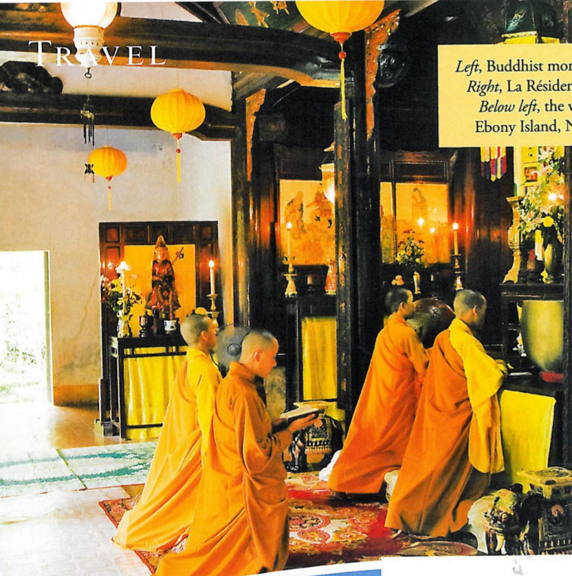
Left, Buddhist monks at prayer. Right, La Residence in Hue. Below left, the waters off Ebony Island, Nha Trang