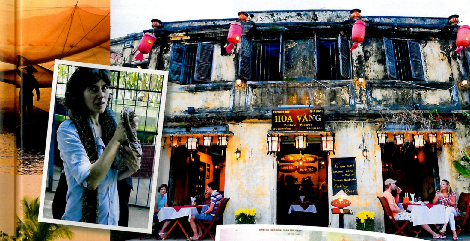
Clockwise from top left, a fisherman at dawn in Hoi An; Bella with a python; cafés in Hoi An's Old Town; James with North Vietnamese Army veterans; Don Bet, on the Mekong River

< the paper-thin galettes before wrapping them up like fat cigars. After a week of this kind of food – eating, as my wife Bella did, My Quang soup for breakfast each day – you feel markedly light and energised, very pure indeed. The soul of Vietnamese food, as any scholar will tell you, is in the stock, which is superior to any other, a subtlety owed in secret part to the grilled onion, star anise and cinnamon, which is added only in the last hour of the four hours or so of conventional bone simmering.