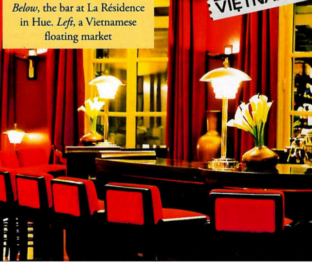
Below, the bar at La Residence in Hue. Left, a Vietnamese floating market