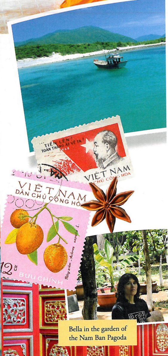
Bella in the garden of the Nam Ban Pagoda