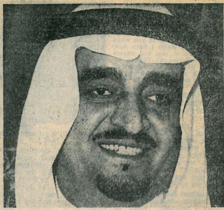
JAMES FOX , in Riyadh, interviews the new Saudi strongman Prince Fahd (pictured above) and investigates the circumstances of the assassination of King Faisal (right)